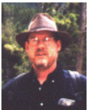
Bill Vins Chemical Solutions - Mesa, Arizona

The problem you will have is that the gold cyanide won't be fully removed if you try to regenerate the resin. You are better off just sending it to a refiner to have it ashed for metal recovery when the resin is loaded.